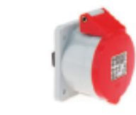
Panel Mounting Socket