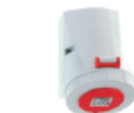
Surface Mounting Socket