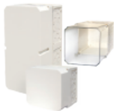
Modular Distribution Board