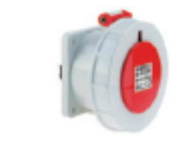
Panel Mounting Socket