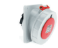
Panel Mounting Socket