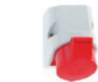
Surface Mounting Socket