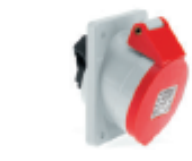
Panel Mounting Socket