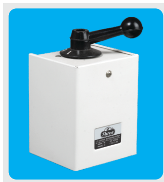
HSN CODE - 85365010