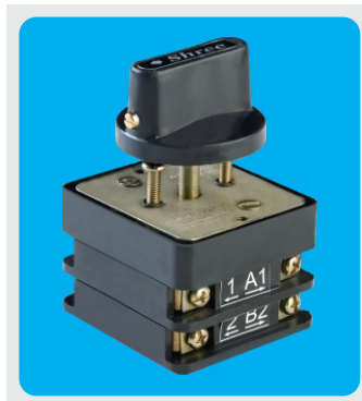
HSN CODE - 85365010