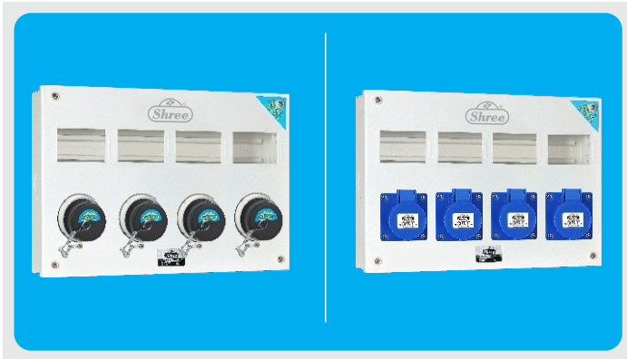
HSN CODE - 85371000