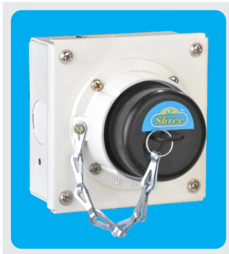
HSN CODE - 85371000