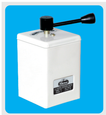
HSN CODE - 85365010