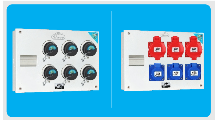
HSN CODE - 85371000