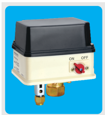
HSN CODE - 90322090